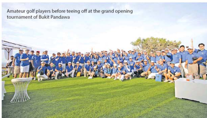
Amateur golf players before teeing off at the grand opening tournament of Bukit Pandawa

In addition, PT Ragawisata is developing a reverse osmosis water purification facility to produce fresh water from seawater to meet the needs of all its properties to be developed around the golf course.